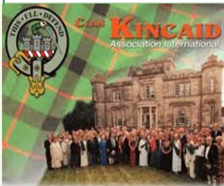
Welcome to the Clan Kincaid website!