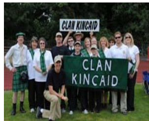
Members of Oregon Clan Kincaid