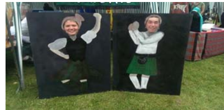
Young Kincaid's at the MI Clan gathering

I believe we need a section for the young Kincaid Clan members to express their views on matters of interest to the Clan. It would be great if one of the younger folks would send me an article to put in this spot. Anyone out there want to take on the challenge?