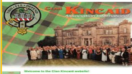
Picture of the 2003 Clan Kincaid Gathering at The Kincaid House Hotel

Clan Kincaid Association, International joined the Council of Scottish Clans and following is a note from the Council's President. It is hoped that this relationship will grow and we can benefit from working with other Scottish clans.