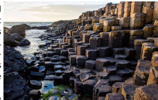
Giant's Causeway— Northern Ireland

So impressed was Felix Mendelsohn when he visited Fingal's Cave on the Isle of Staffa in 1829 that he wrote "The Hebrides Suite" the following year. For your listening enjoyment, it is recommended that you listen to: https://www.youtube.com/watch?v=zcogD-hHEys while enjoying pictures of the Giant's Causeway and Fingal's Cave.