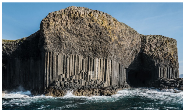
Fingal's Cave—Isle of Staff Scotland