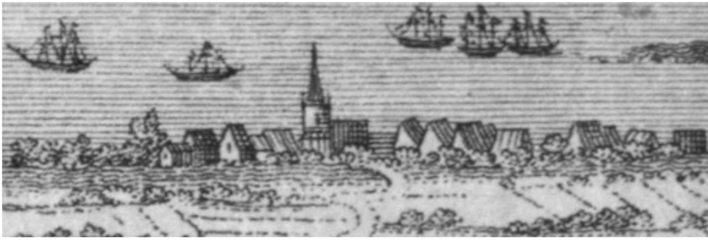
Depiction of ships off the coast of Leith, 1685—Jardine's Book of Martyrs